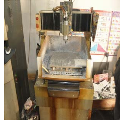
(3)Open mould area