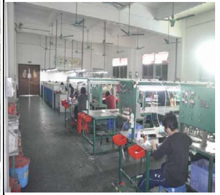
(6)Injection molding ,dropping glue ,bakeout area