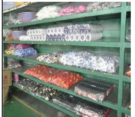
(9)Final products strage area